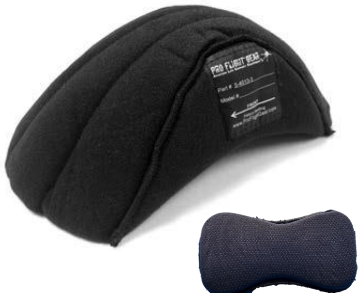
PFG-3-NPG: Nape Pad for HGU-56/P with new Harness system (prevents roll when fitting helmet)