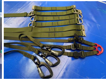
(LEFT) STRETCHER WHEEL/POST SWING ARMS (RIGHT) STRAPPING AND BUCKLES